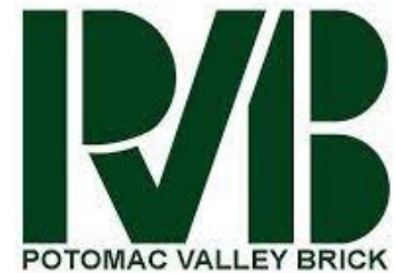
POTOMAC VALLEY BRICKS- Session Sponsor