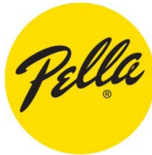
PELLA MID ATLANTIC - Session Sponsor